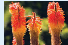
Red Hot Poker