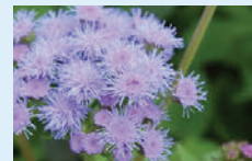
Fragrant Mist Flower