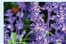
Sage, Mealy Blue