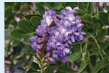
TX Mountain Laurel